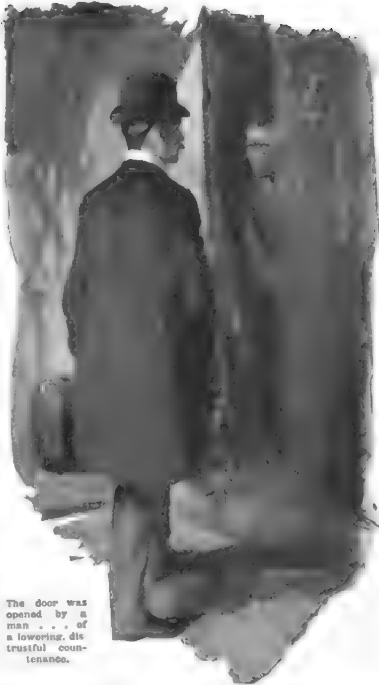
The door was opened by a man . . . of a lowering, distrustful countenance.

she left here," he said, fawning all at once.